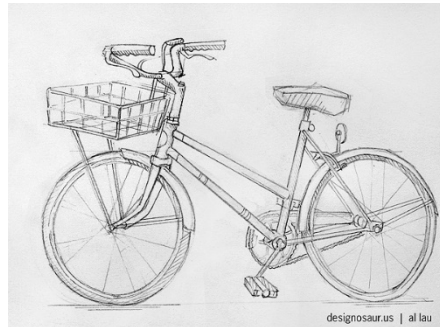
This drawing is detailed, well drawn & proportions are correct. This would receive high points.