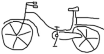
This drawing is NOT acceptable & will get very little points-not passing!